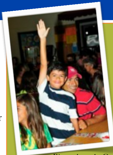
Bingo night Fun!